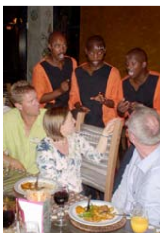
Entertainment in true South African way right to our table.