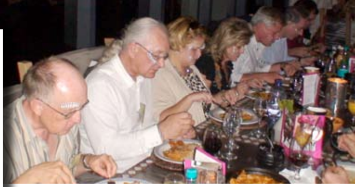
Ready for war!