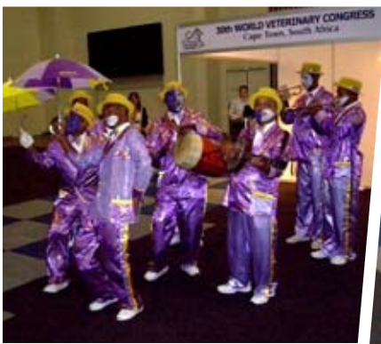
Cape Minstrel Band, a true Capetonian experience